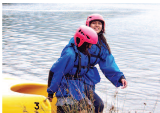
The Metropolitan Police Service's Voluntary Police Cadets programme provides positive and structured activities for disadvantaged young people