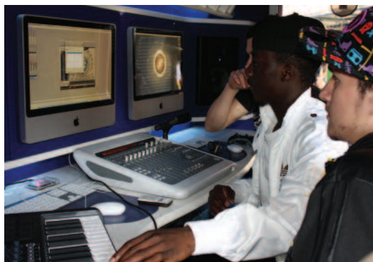
Young people at youth charities told the Working Group that family breakdown and drug addiction were key drivers of gang involvement

Worryingly, the Working Group was told by senior police officers and practitioners that gang members are getting younger and this appears evidenced in the declining age of gun crime offenders: 18 the rise of the young soldiers.