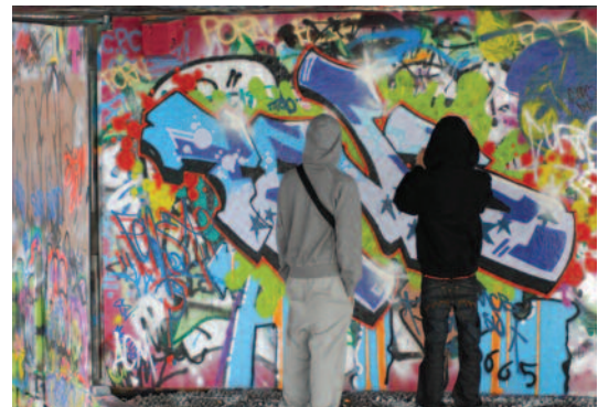
Gangs are most commonly found in areas of high deprivation, crime and family breakdown

This report analyses the true nature and scale of gang culture in Britain; who is involved and what they are involved in; how Britain has reached this point; and what society can do to tackle it.