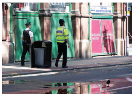
Tackling gangs has too often been left to police. A multi-agency approach is needed