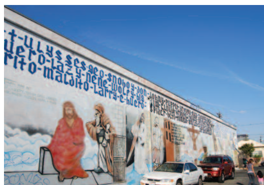
The Working Group visited Los Angeles to learn about the city's Gang Reduction and Youth Development programme. This mural in one of LA's most gang-impacted neighbourhoods has the names of murdered gang members along the top

Furthermore, gang membership itself has a direct impact on an individual's offending, over and above the impact of affiliating with delinquent peers. The OCJS found that 63 per cent of gang members admitted committing an offence in the previous 12 months compared to 43 per cent of non-members with delinquent friends. 25 Gang membership was also found to increase offending behaviour in a number of U.S. studies. 26